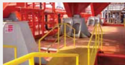
7: Stools & Foundations