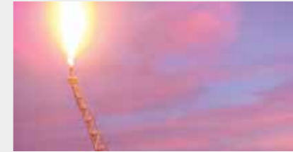
2: Flare Towers