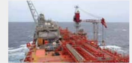
3: Crane Integration