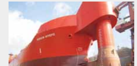
6: Hull Engineering