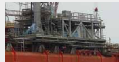
8: Utility Modules