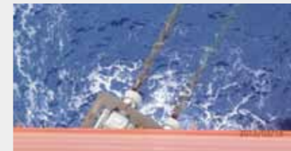
5: Moorings & Risers